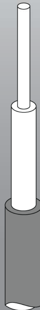
DC – 20 GHz

Temperature range -55 to +125°C Bending radius 6,5 mm (proper tooling)